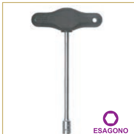
CHIAVI A BUSSOLA ESAGONALE CON IMPUGNATURA A "T"