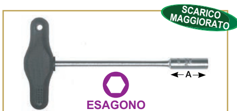
CHIAVI A BUSSOLA ESAGONALE CON IMPUGNATURA A "T" E SCARICO MAGGIORATO 35/50 MM