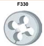
No.4 - 1,1/2