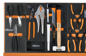
M137 M153 M237 M145