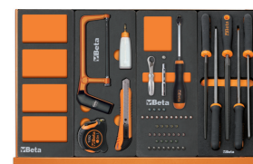
VPM3 M289 M85 M236