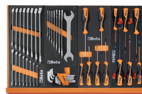
M05 M33 M204 M201