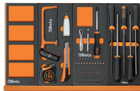
VPM3 M289 M85 M236